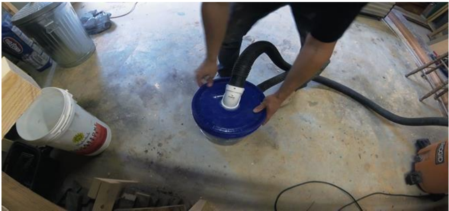
Figure 2: Industrial Air Dust Removing and Air-Cooling Machine