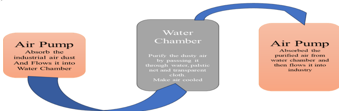
Figure 1: Flow chart of working principles for Industrial Air Dust Removing and Air-Cooling Machine